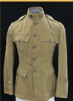
Model 1912 uniform coat, WWI