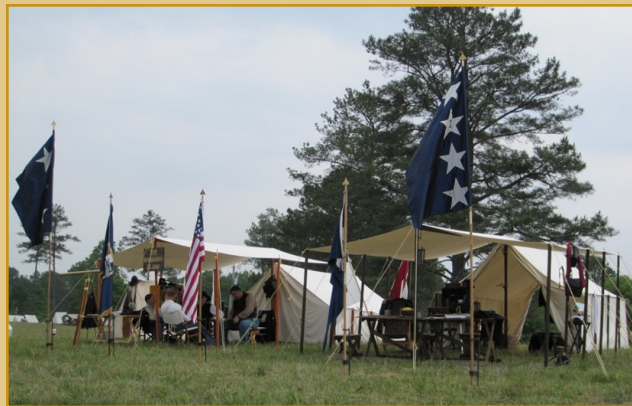
Headquarters display, Resaca, Georgia

The living history program brings the past to life, relating the soldier's experience in America's wars. The Office of Army Reserve History portrays a Civil War headquarters and signal station at historic events.