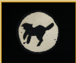
81st Division Shoulder Patch