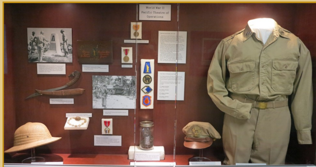
WWII display of Army Reserve Divisions in the Pacific Theatre

Museum displays throughout the headquarters tell the story of America's federal Citizen Soldiers, relate their experiences and honor their contributions. The development of the Army Reserve is highlighted, along with displays that emphasize its most significant achievements.