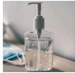
Stock File Images

These items do not meet FDA and DOD requirements and must not be used until further notice. (USARC OPCODE PENDING)