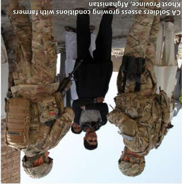
CA Soldiers assess growing conditions with farmers Khost Province, Afghanistan

CIVIL AFFAIRS OFFICER (38A) Civil Affairs officers engage civil components within a military operational area and enhance, or provide governance to gain and maintain influence, consolidate military gains, and create effects.