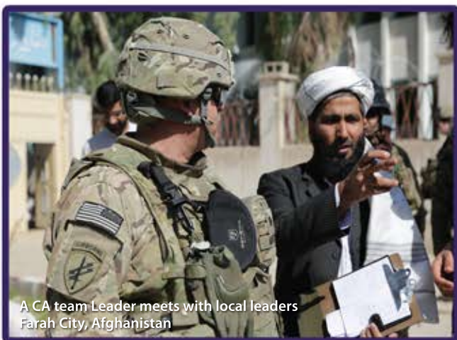
A CA team Leader meets with local leaders Farah City, Afghanistan

* 85% of Army Civil Affairs forces and 83% of the Army Psychological Operations Forces are in USACAPOC(A)